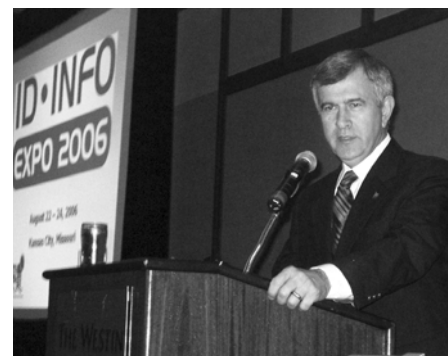
secretary mike johanns

The second component of NAIS, identifying animals individually or by group/lot with a unique identification number, is progressing. Animal identification is available now for several species. The States and industry continue working on this component so that it will eventually be an option for all species. In support of this work, USDA has approved two companies to manufacture animal identification number (AIN) devices, and a third has submitted devices for approval. USDA is also in the process of approving AIN managers who will be authorized to distribute devices.