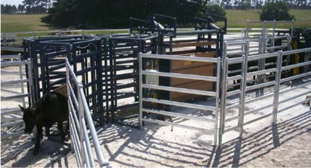
5 way fully automatic Cattle weighing /drafting unit

To completely take advantage of RFID technology, Boontech also supply complete handling units for Cattle/Sheep/Swine & Goat.