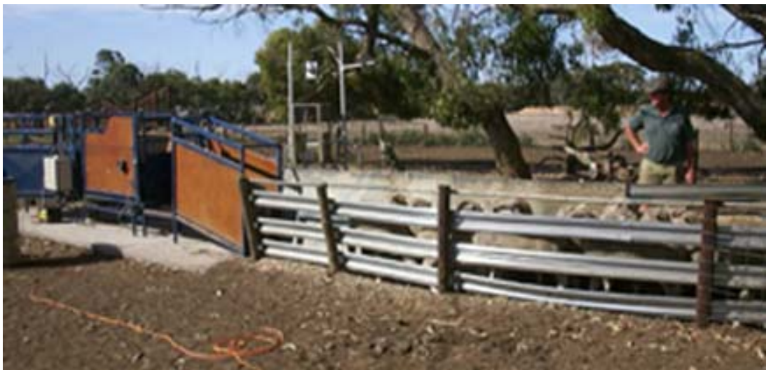
5 way fully automatic Sheep weighing/drafting unit